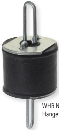
WHR Neoprene Hanger