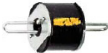
Yellow - 220lb.