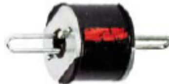
Red - 100lb.