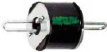
Green - 70lb.