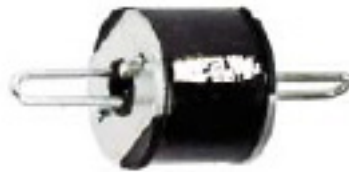
White - 145lb.