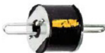
Yellow - 220lb.