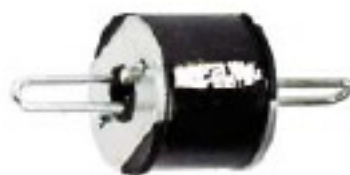
White - 145lb.