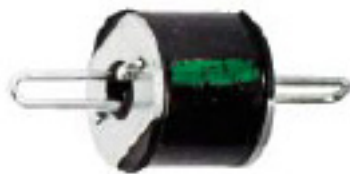
Green - 70lb.