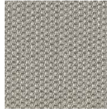
Polished Pewter 1678