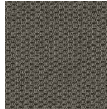
Dark Annealed 1629