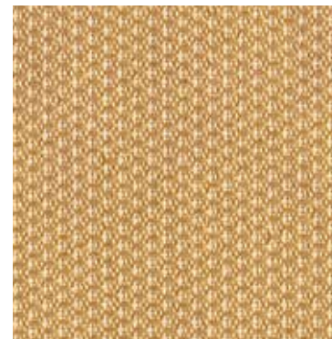
18 Karat 1627