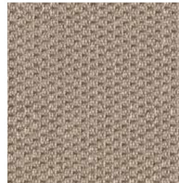
Welded Steel 1677