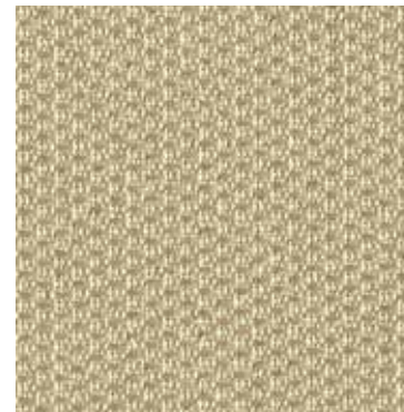
Etched Bronze 1623