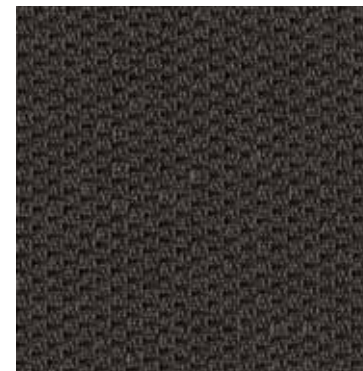
Stove Pipe 1628