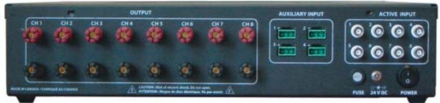
SMS-AMP-8 Back Shown