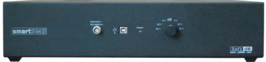
SMS-AMP Front Shown

Smart SMS is designed to provide the best masking sound while preserving the comfort of the occupants. The precise adjustment of the masking sound to the specific characteristics and noise conditions of each work area is what distinguishes this system.