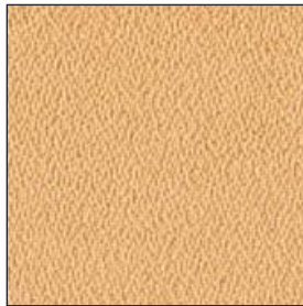
Alabaster - 040

(Colors Shown on Chart are Approximate Match to Material.)