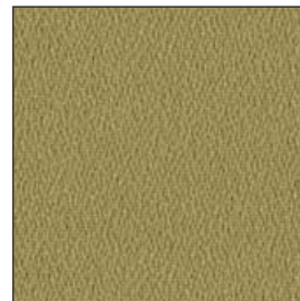
Willow - 030