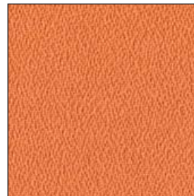
Tangerine - 050