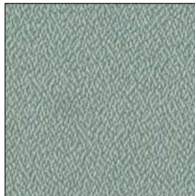
Frost - 090