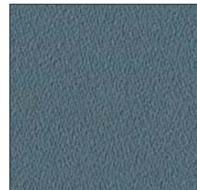
Slate - 070