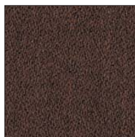
Earth - 080