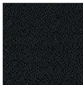
Onyx - 010