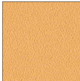
Straw - 041