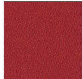
Paprika - 100