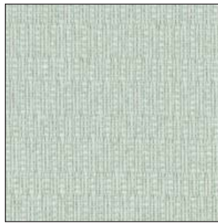
Powder - 7011