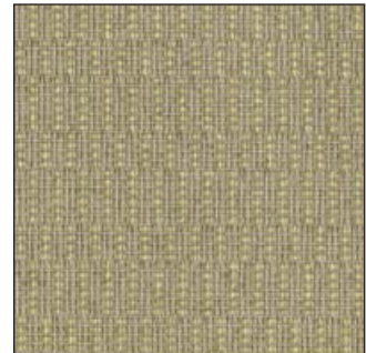
Kiwi - 7031