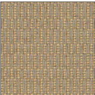
Harvest - 7032