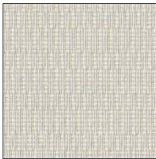
Linen - 7010

(Colors Shown on Chart are Approximate Match to Material.)