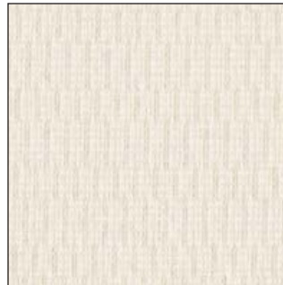
Snow - 7040