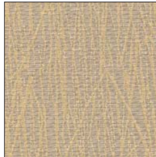
Sand - 041