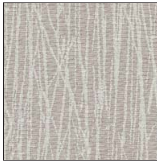
Greystone - 020