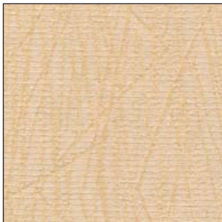
Maize - 040