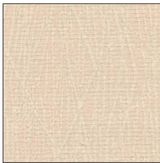
Bisque - 010

(Colors Shown on Chart are Approximate Match to Material.)