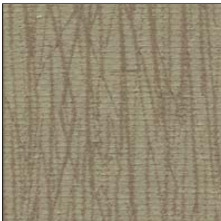
Moss - 051