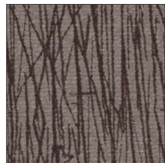
Iron - 030