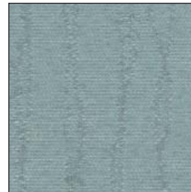
Bluegrass - 070