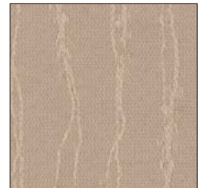
Bluff - 040