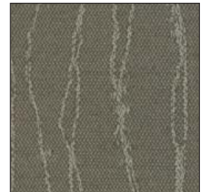
Seal - 080