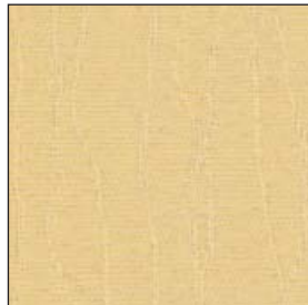
Meringue - 031