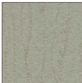
Dove - 081