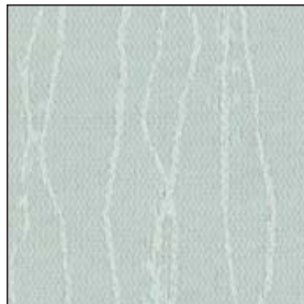
Gull - 010

(Colors Shown on Chart are Approximate Match to Material.)