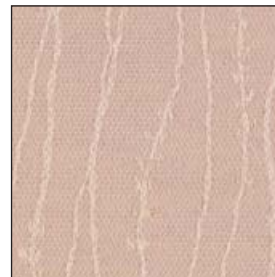
Coral - 021