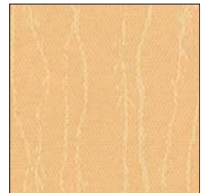
Sunset - 030