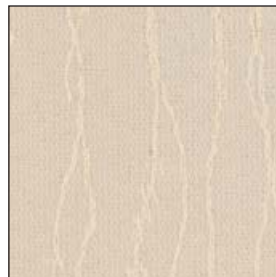
Sand - 020