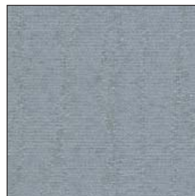
Vapor - 060