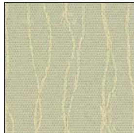
Beach Glass - 032