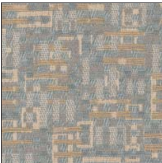
Oasis - 013