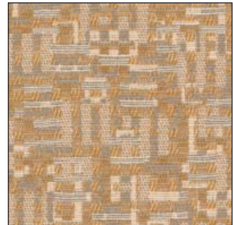
Canyon - 021