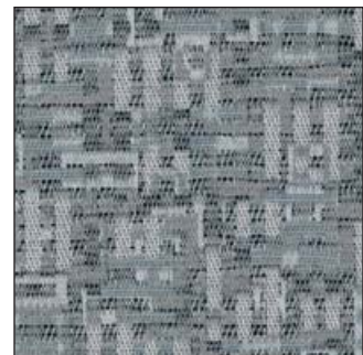
Slate - 012