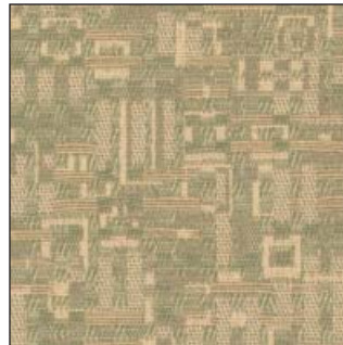
Sprout - 020