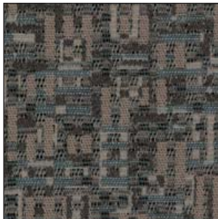
Storm - 030