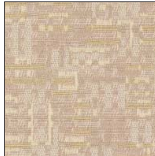
Alabaster - 040