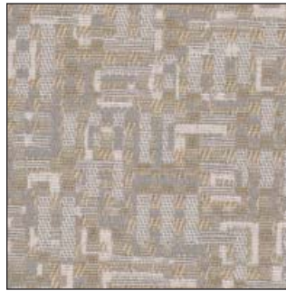
Pebble - 011