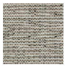
Full Stream 012