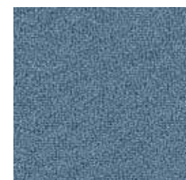
Blue Smooth 2519