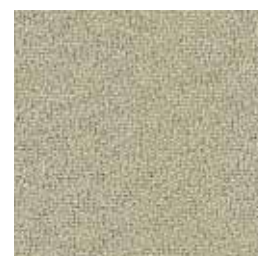
Sandy Pebble 2554