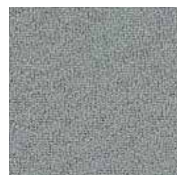
Gray Blue 2553