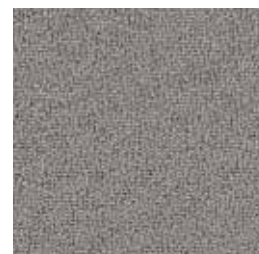
Dove Gray 2689