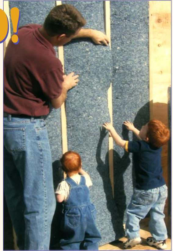
“What’s in Your Walls?”

UltraTouch contains no chemical irritants and requires no warning labels compared to traditional products. UltraTouch contains no harmful airborne particulates that can enter your living area and the surrounding environment causing health concerns. UltraTouch has no VOC outgassing concerns and contains no formaldehyde or fiberglass.