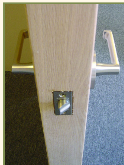
2-3/4" Door Thickness.