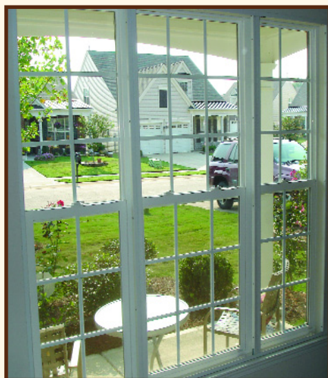
Acoustical Window Inserts.

"You'll Find No Finer Soundproof Doors and Windows at Affordable Prices!"