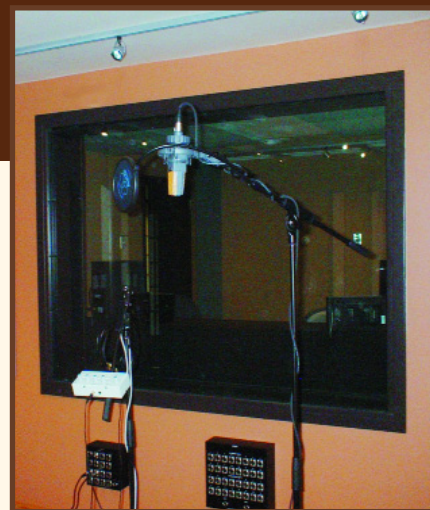
Studio 6 Installed.