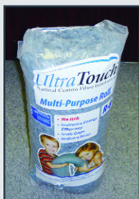
UltraTouch Multipurpose Roll.

Easy Way to Reduce Through the Window Noise!