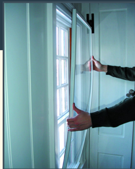
Attachments Made Easy.

Many other competitive retrofit window products require a permanent secondary layer, which we feel is restrictive and excessive. Because of its unique magnetic attachment method, the Noise S.T.O.P. Climate Seal™ Acoustic Series Window Insert is easily removed in seconds for access to the window for cleaning or maintenance. Reattaching the window