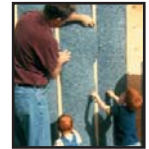
R-13 or R-19 Installation