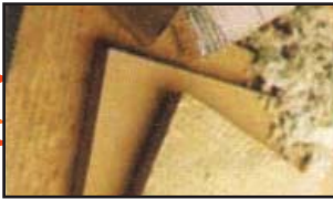
ASI FIRESTOP Mineral Wool

Unequaled fire, thermal & acoustical performance, 0 Flame spread, 0 smoke developed. Outperforms glass fiber, cellulose & other insulation in many characteristics. See our website for complete product information, test & technical data on the following: