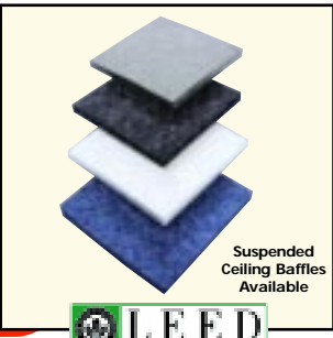
Suspended Ceiling Baffles Available