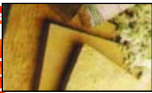
ASI FIRESTOP Mineral Wool

Unequaled fire, thermal & acoustical performance, 0 Flame spread, 0 smoke developed. Outperforms glass fiber, cellulose & other insulation in many characteristics. See our website for complete product information, test & technical data on the following: