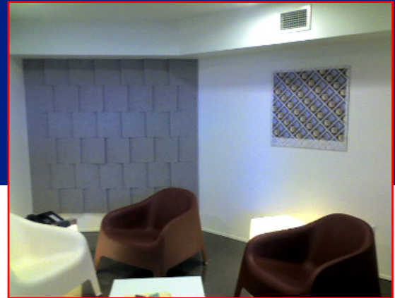
Worrell used the 8" round BAP Blade to cut the panels into 1 x 1 squares and installed them in an alternating overlapping pattern.

Since installing the panels we've enjoyed a discernable difference in the acoustic quality of our conference rooms and offices, creating better phone clarity as well as cleaner sound for video presentations and other audio playback. We would definitely recommend these panels to other organizations for their workspaces, and give an additional nod to Acoustical Surfaces, Inc. for their great service helping to create a customized solution.