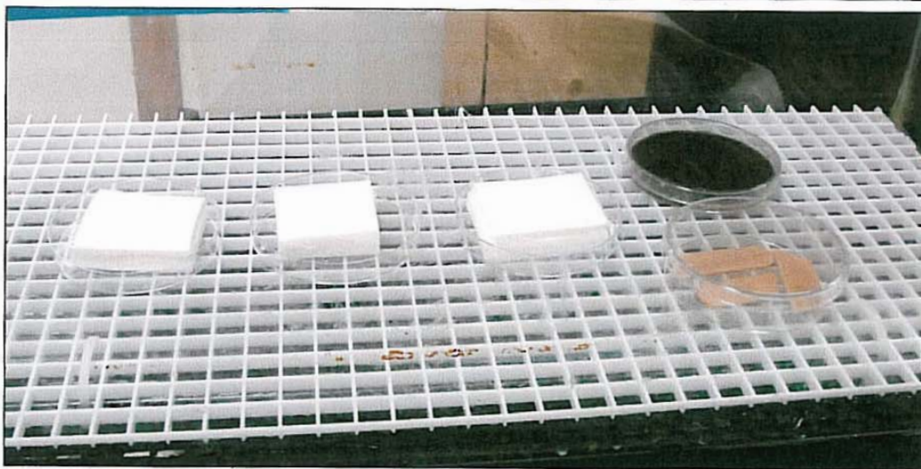
Pictured above are the three replicates tested of sample Poly Max™ 9.4 PCF ½” (100% Polyester Acoustic Panel) and the test controls in the test chamber at Day 21.