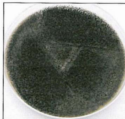
The picture on the left is of the sterile tongue blade control at Day 28 which was inoculated with the test inoculum. The picture on the right is of the sterile paper strips at Day 28 that were placed on the agar surface and inoculated with the test inoculum. Both inoculum controls verify that the test inoculum was appropriate and viable.